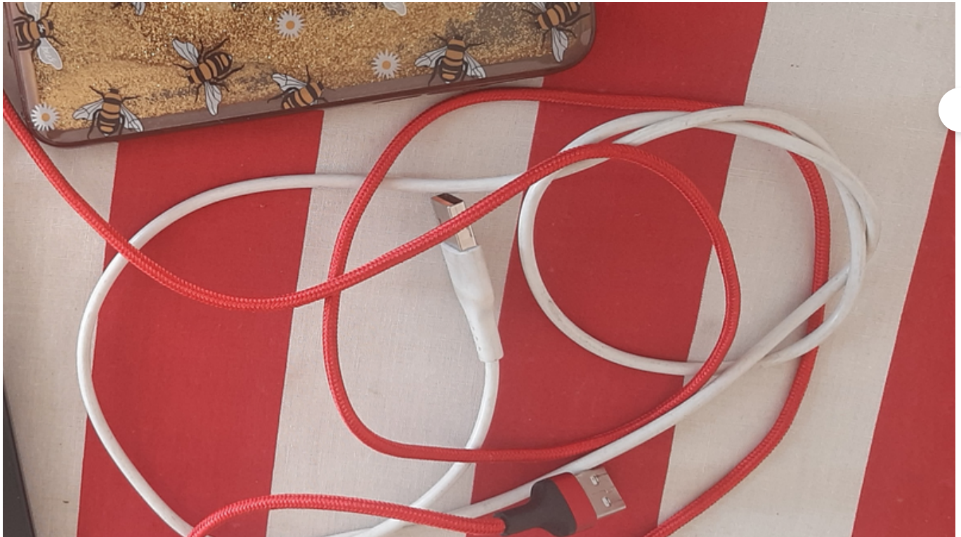
Old devices and cables are among the unused e-waste wanted for recycling.