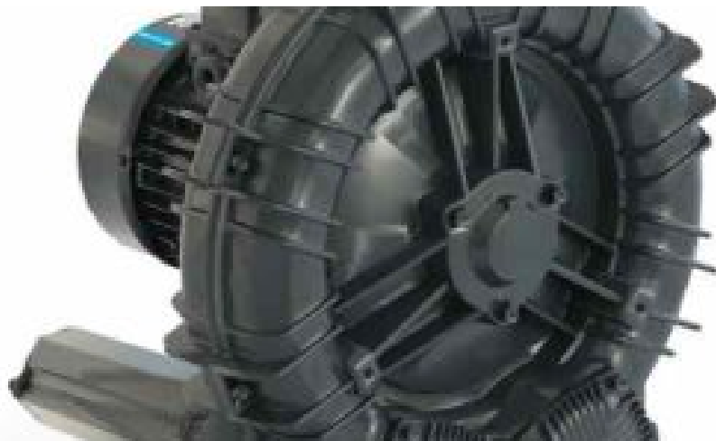
( https://samechanicalengineer.co.za/efficient-side-channel-blowers/ )