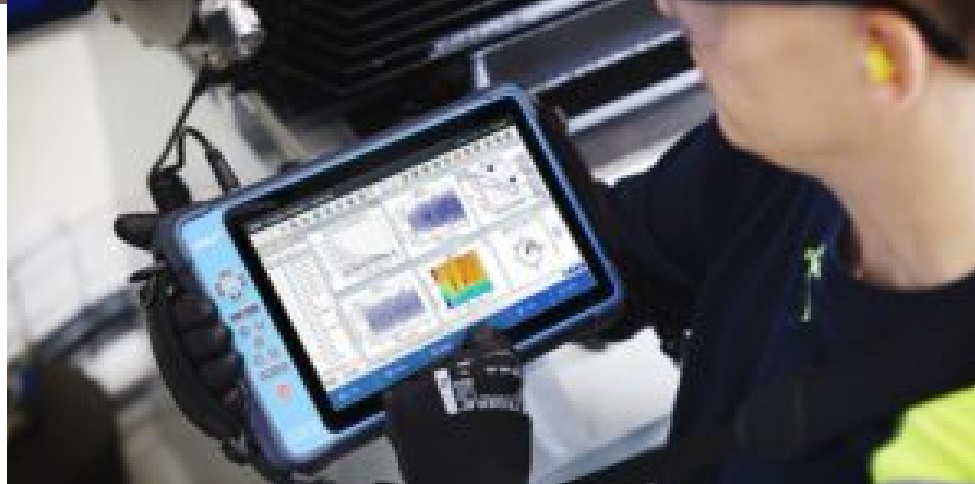
( https://samechanicalengineer.co.za/powerful-diagnostic-tool-for-condition-monitoring/ )