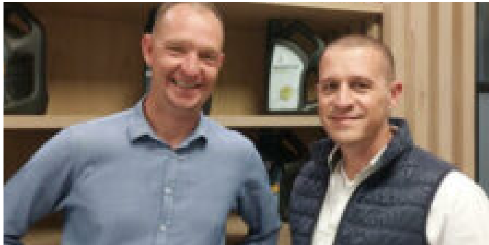
( https://samechanicalengineer.co.za/lubricant-for-commercial-truck-fleets/ )